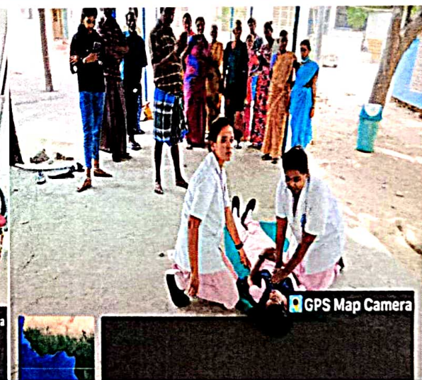
Clinical simulation training on CPR