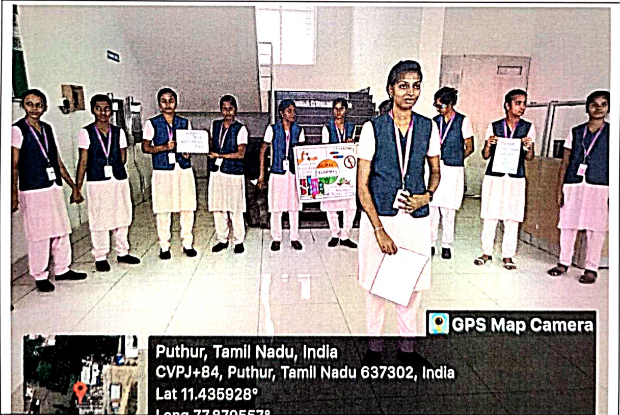
Role Play –To create awareness on Drug abuse