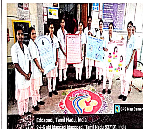
Awareness Program on World Breast feeding week at Edappadi GH