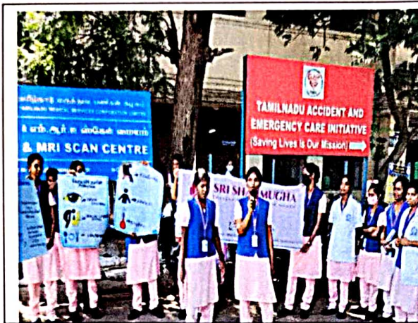
Awareness Program on World Asthma day at Erode GH