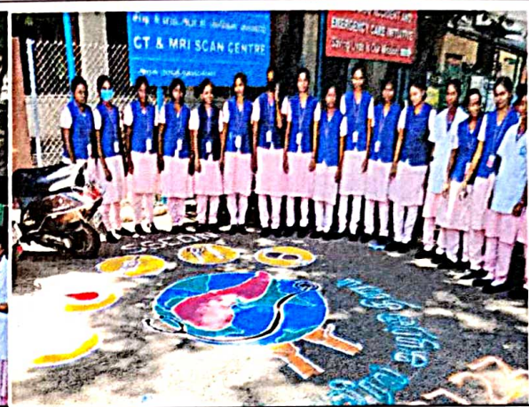
Awareness Program on World Hepatitis day at Erode GH