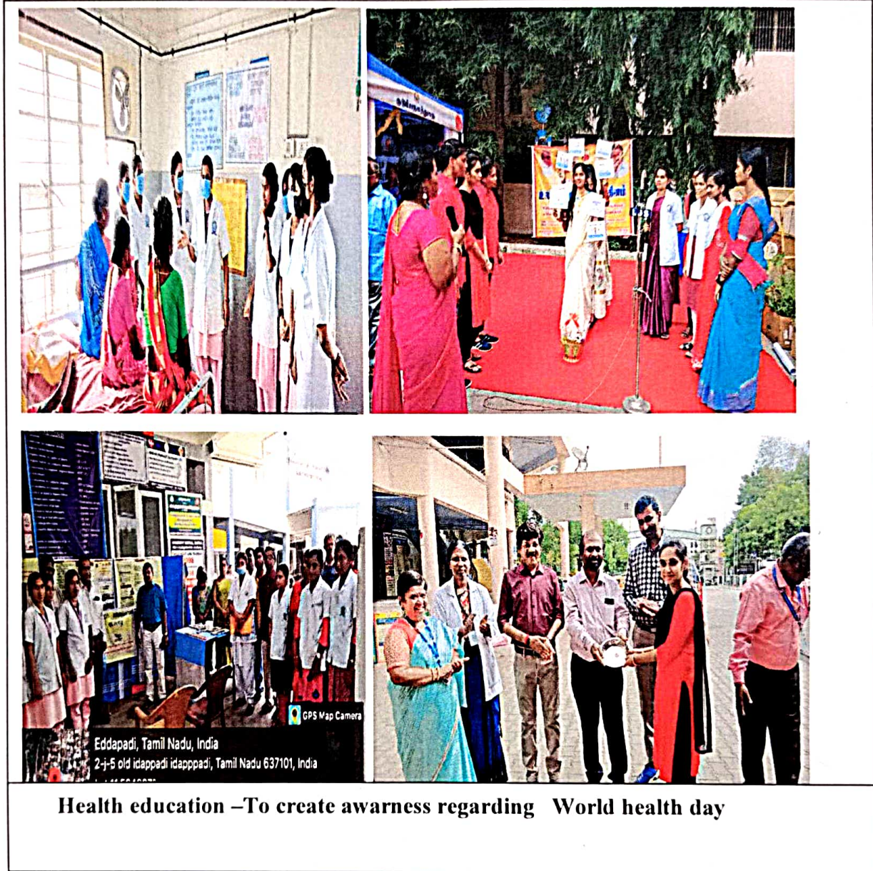
Health education -To create awareness regarding World health day