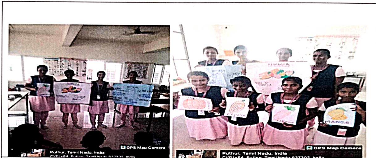
Poster Presentation for Therapeutic Diet