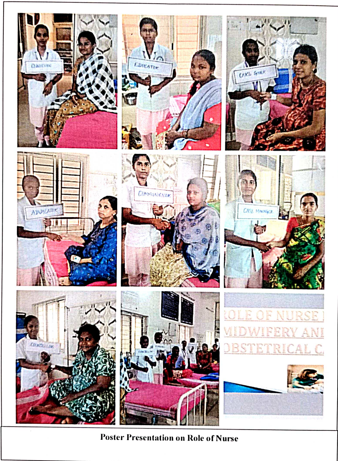
Poster Presentation on Role of Nurse