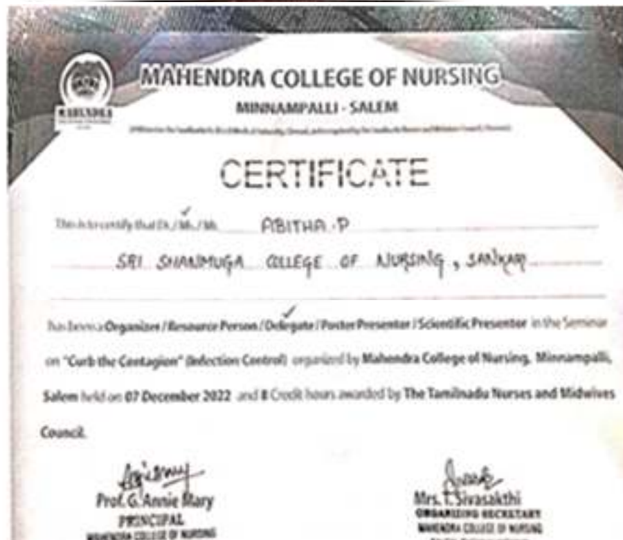
State level conference and seminar participation