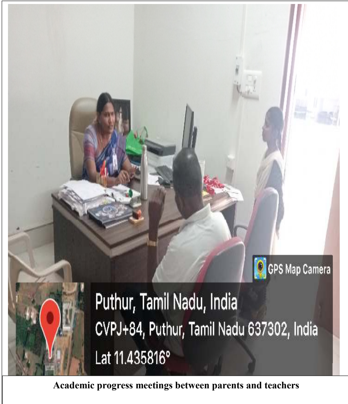
Academic progress meetings between parents and teachers