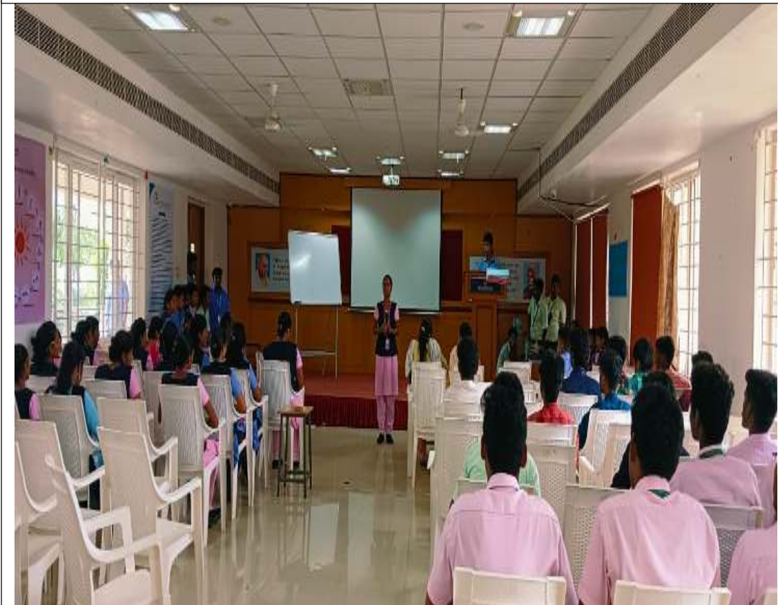
Intra college Elocution competition