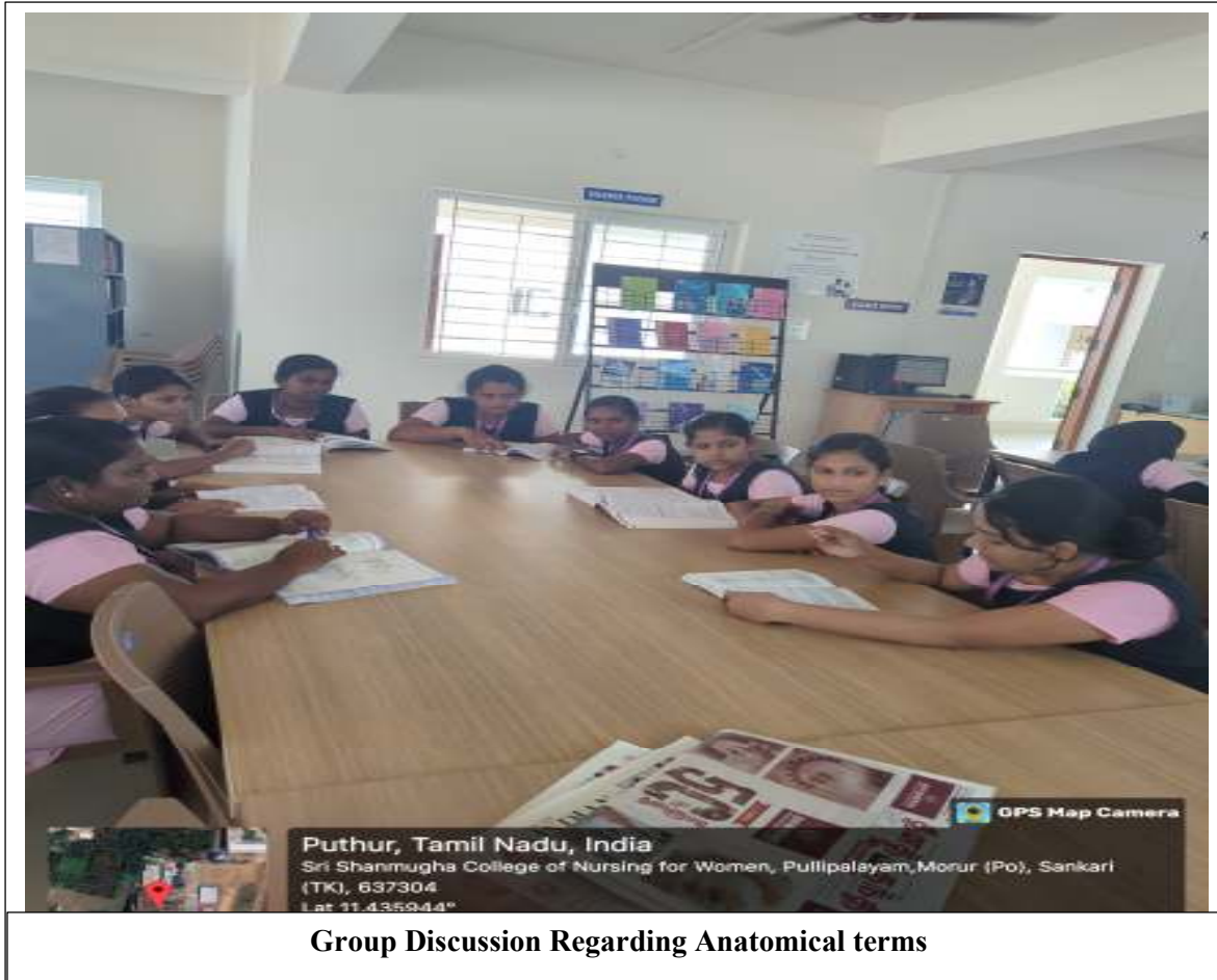
Group Discussion Regarding Anatomical terms