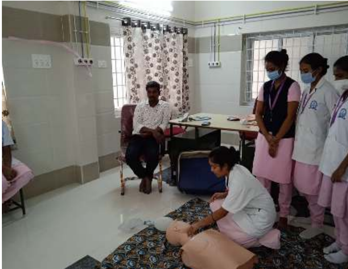
Promote peer support BLS techniques at Edappadi GH